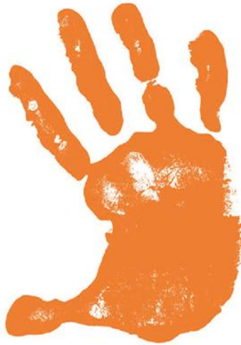
Figure 1: Stop violence against women